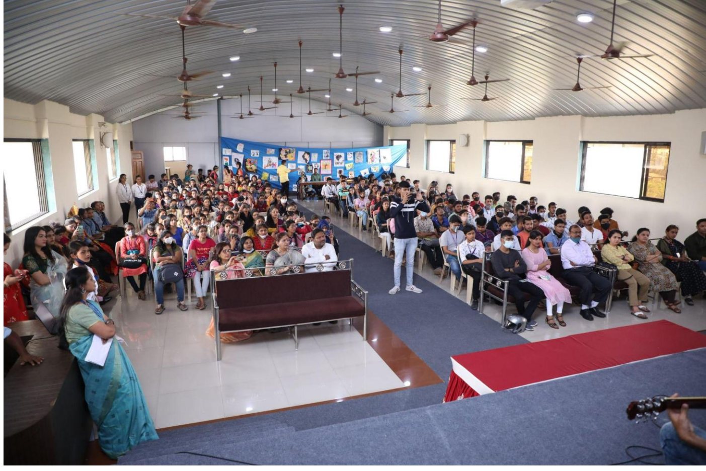
Poetry recitation on 8th March the topic "Women Empowerment" with 04 participants.