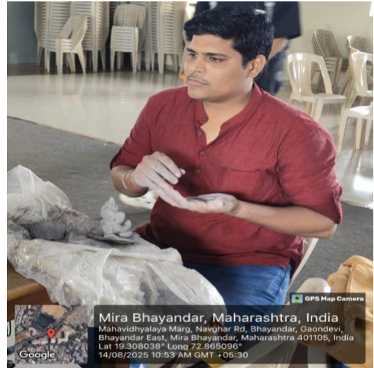
Mira Bhayandar, Maharashtra, India Mahavidyalaya Marg, Navghar Rd, Bhayandar, Gaondwi, Bhayandar East, Mira Bhayandar, Maharashtra 401105, India Lat 19.308038° Long 72.865096° 14/08/2025 10:53 AM GMT +05:30 Google