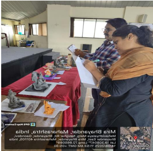
Mira Bhayandar, Maharashtra, India 14/08/2025 11:23 AM GMT +05:30 Google