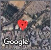
Mira Bhayandar, Maharashtra, India 8v48+x5p, Navghar Village, Navghar Gaon, Bhayandar East, Mira Bhayandar, Maharashtra 401105, India Lat 19.307845° Long 72.86575° 14/08/2025 12:28 PM GMT +05:30